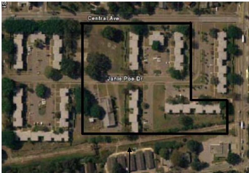
Phase I Relocation Area

JANIE POE (Phase I) Central Avenue Sarasota, Florida